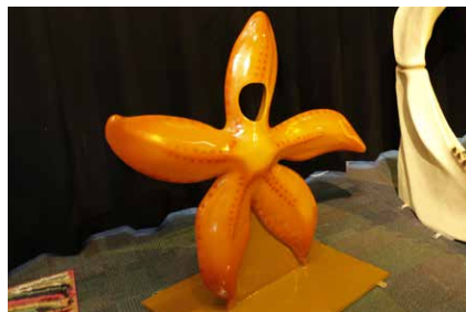
Starfish Photo Op